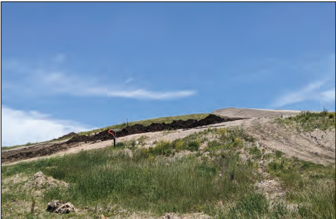
Top soil recovery at Phase transitions