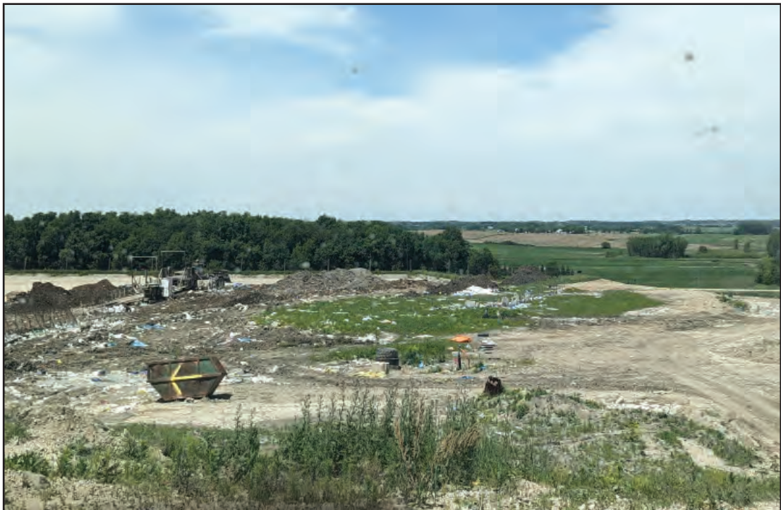
Limits of litter outside of active area