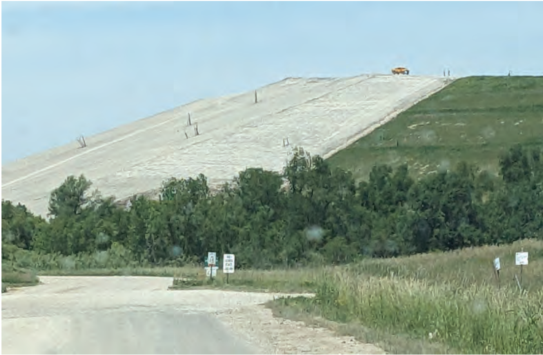
West slope of Phase 3, cap construction