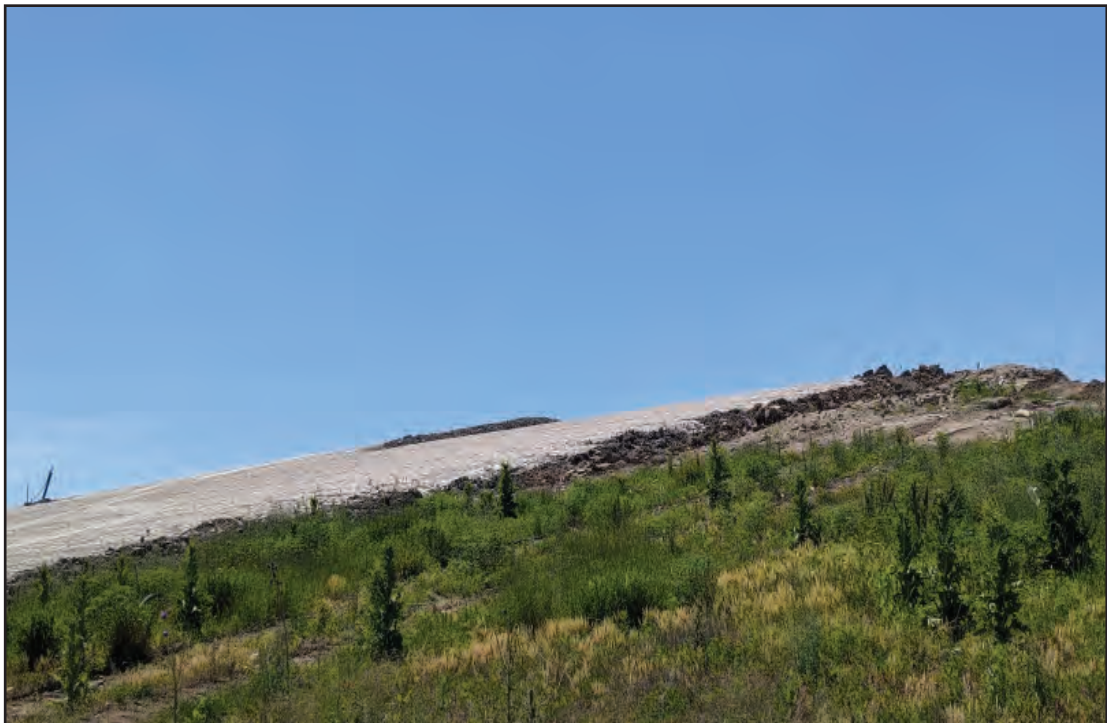
East slope/cap of Phase 3