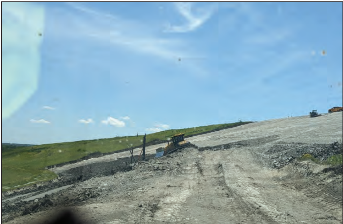
East slope/cap of Phase 3; clay being placed