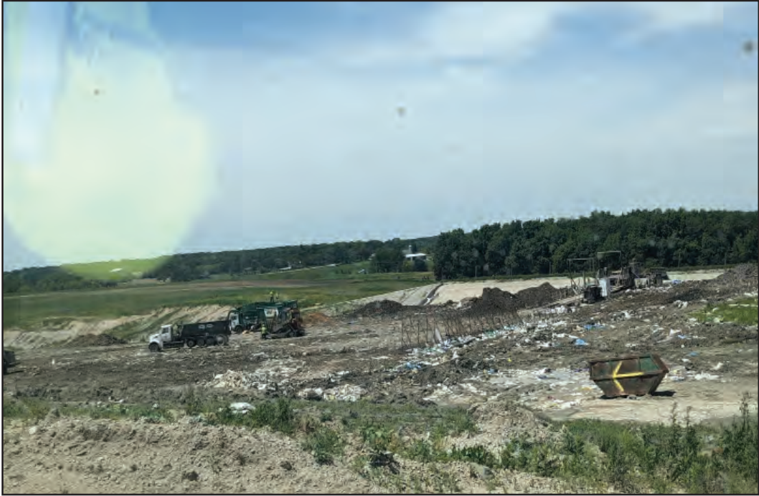
overview of active area