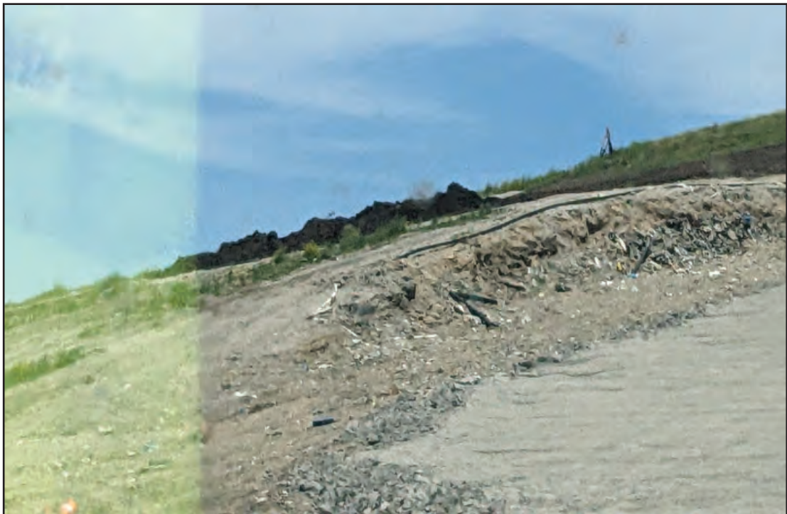
Transition between cap and intermediate cover