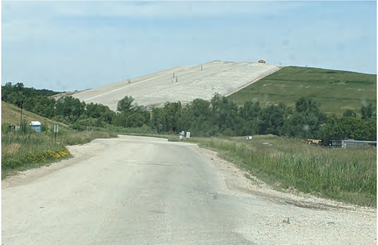
Clay cap nearly complete, when finished top soil will be placed