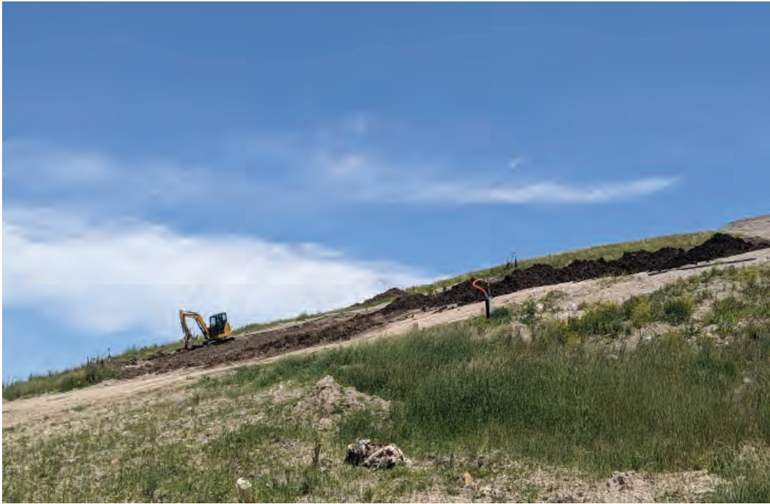
Soil work at cap edge