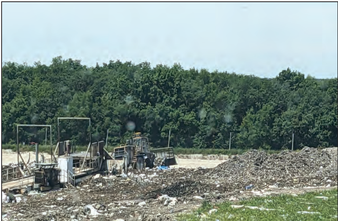
Compactor clearing tipper