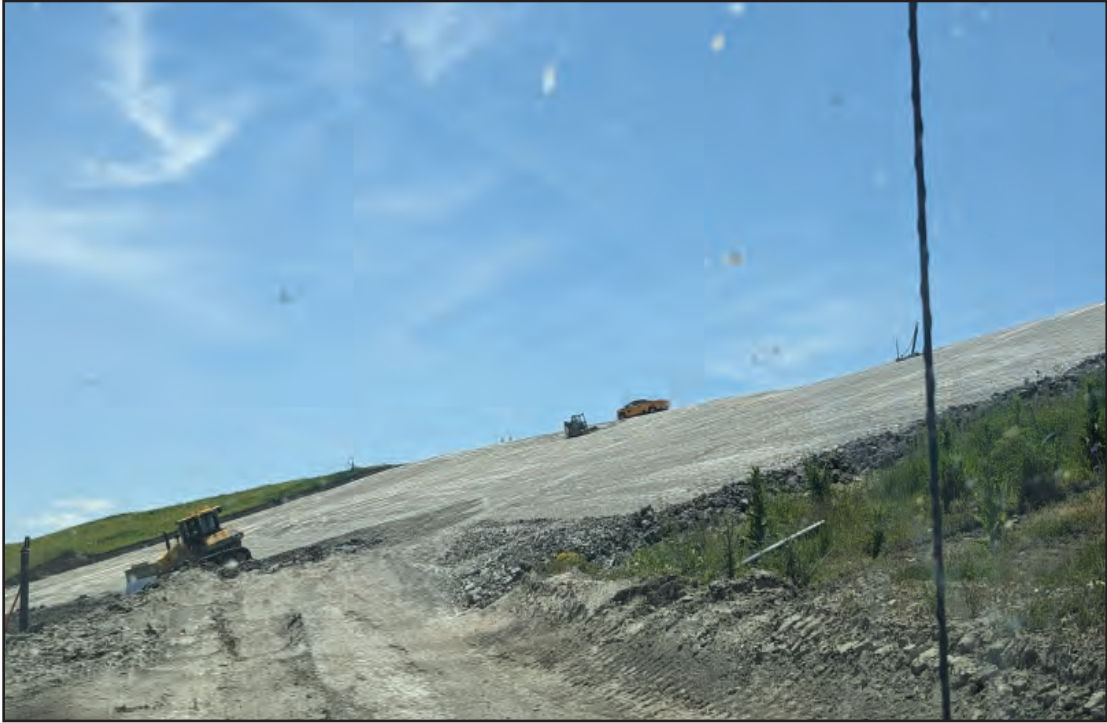
East slope/cap of Phase 3