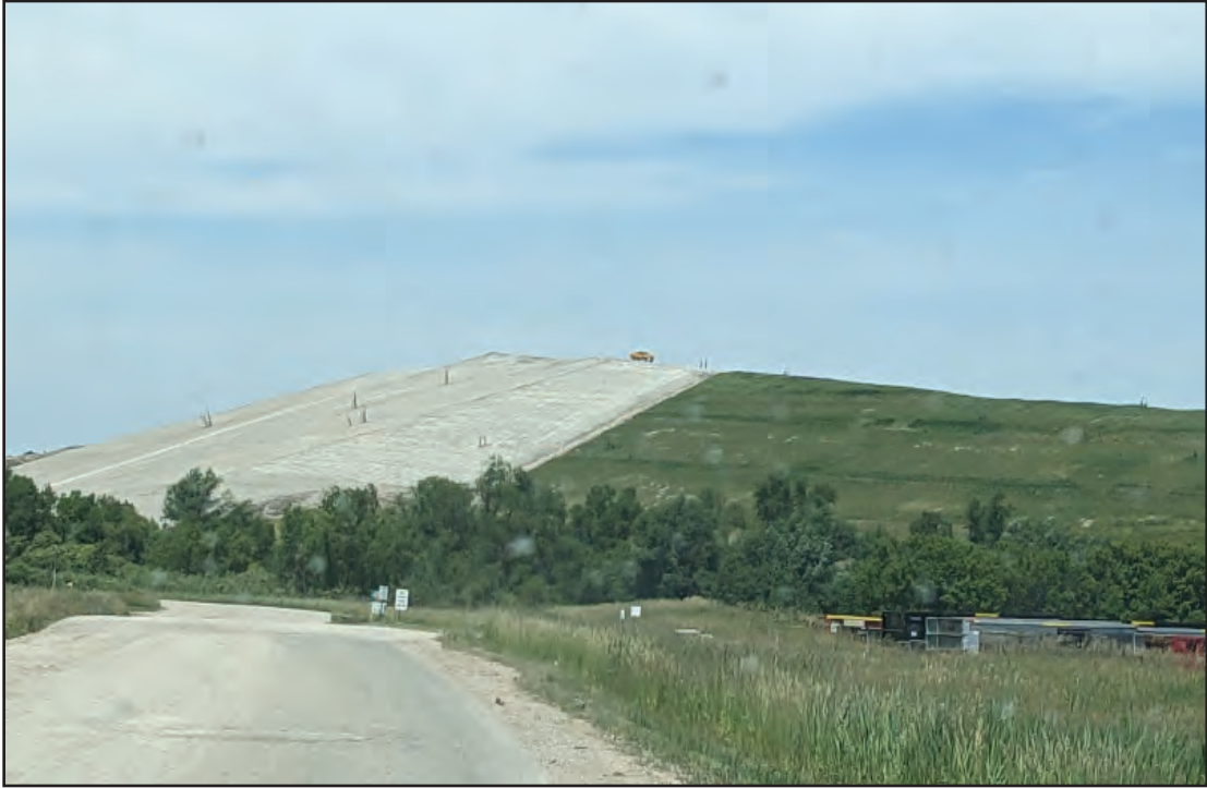
Clay cap nearly complete; West slope of Phase 3, cap construction