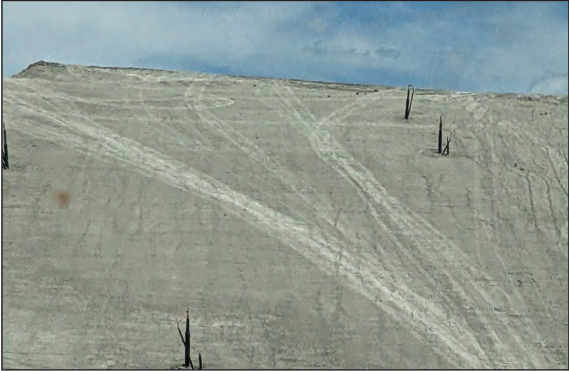
West slope of Phase 3, cap construction