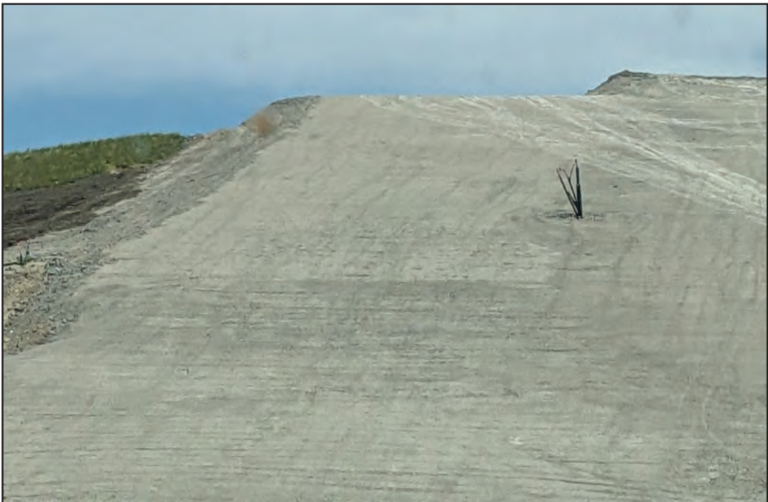
West slope of Phase 3, cap construction