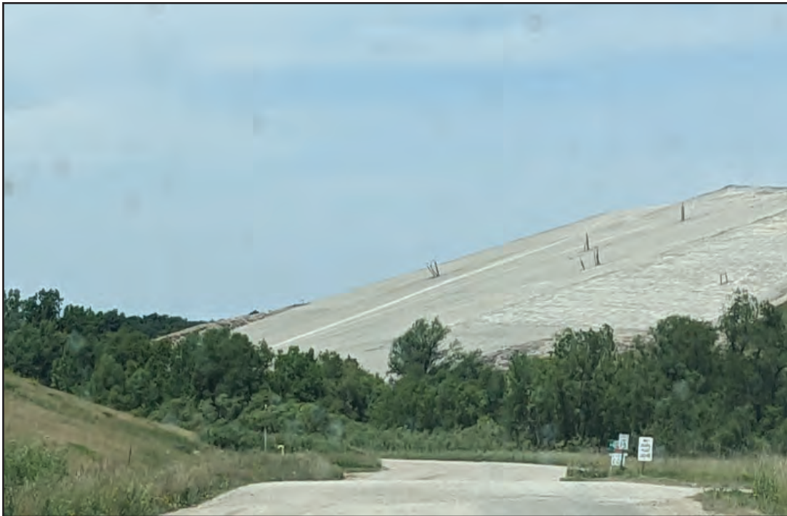
West slope of Phase 3, cap construction