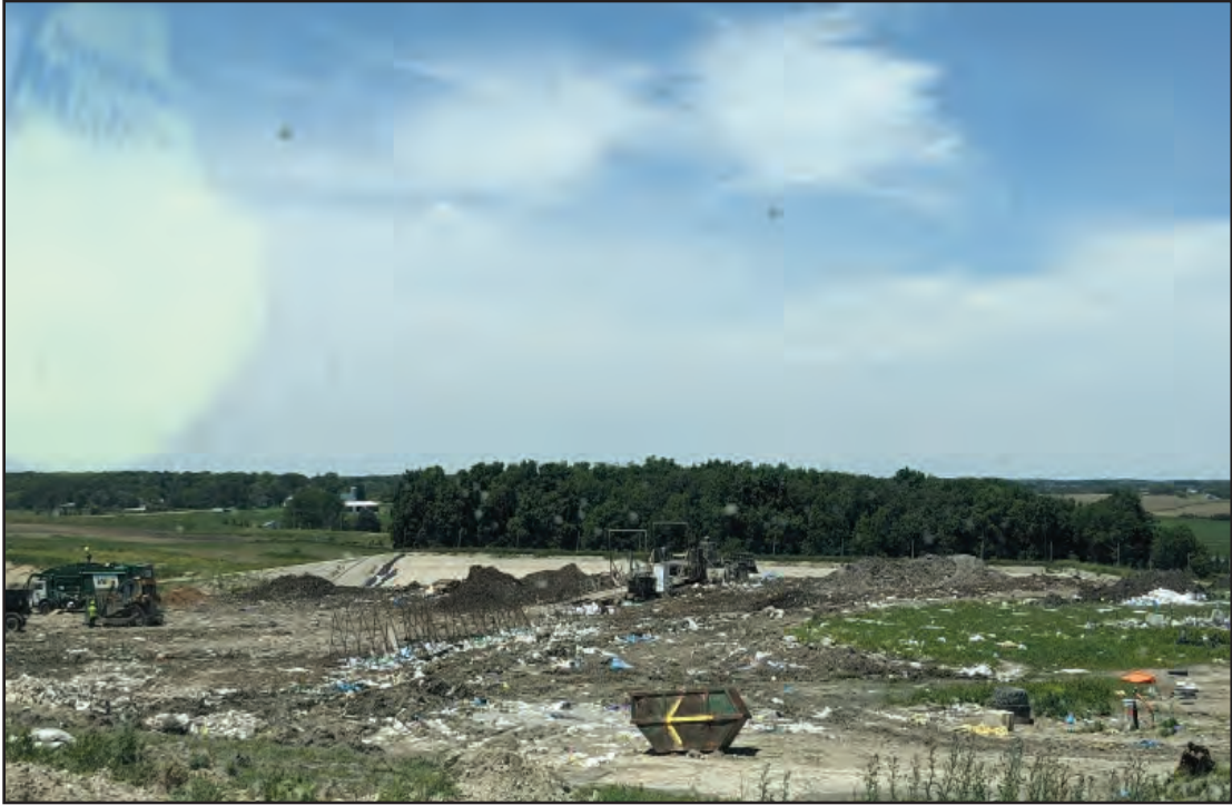
Litter about active area