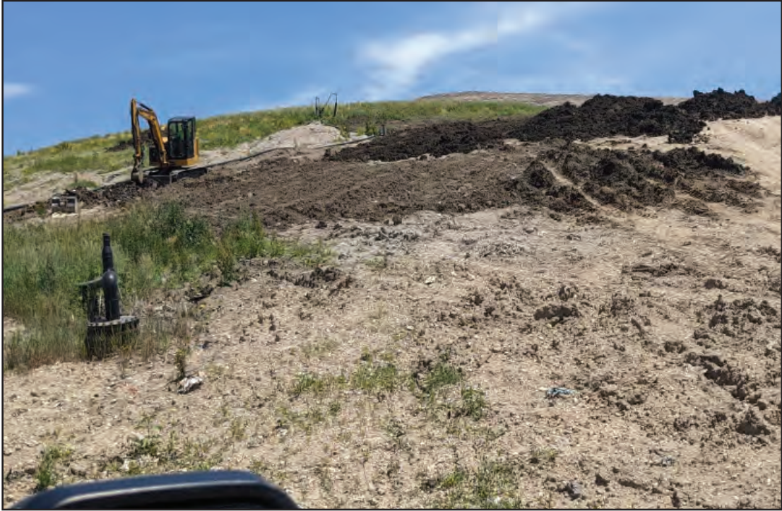
Top soil recovery at Phase transitions